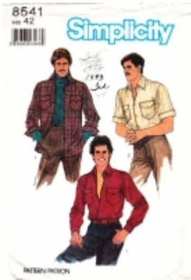
Simplicity 8541 Men's Button Front, Patch Pocket, Long or Short Sleeve Shirt Sewing Pattern 42 Used $5.00

MEN'S SHIRT: The top-stitched shirt with button and buttonholes or decorative snap fasteners, has yoke, collar and collar band, set-in sleeves, shirt-tail hem and pockets with flaps. V. 1 has long sleeves with cuffs. V. 2 has short sleeves with tuck detail [Product Details...]