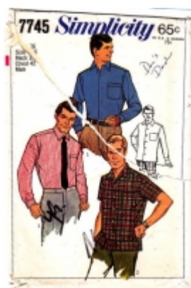
Simplicity 7745 Men's 1960s Tapered Button Front Sport Shirt Sewing Pattern 42 Neck 16 Used $5.00