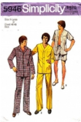
Simplicity 5946 Mens Pajamas Top, Pajama Pants & Shorts Sewing Pattern XL C46-48 Uncut $5.00

MEN'S SHIRT: The top-stitched shirt with button and buttonholes or decorative snap fasteners, has yoke, collar and collar band, set-in sleeves, shirt-tail hem and pockets with flaps. V. 1 has long sleeves with cuffs. V. 2 has short sleeves with tuck detail [Product Details...]