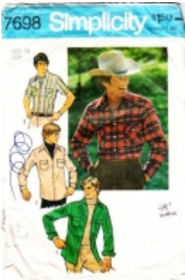
Simplicity 7698 Men's Western Button Snap Front, Flap Pocket Shirt Sewing Pattern 44 Used $5.00

MEN'S PAJAMAS: The pajama top with front button closing, has long set-in sleeves, patch pockets, buttons and buttonholes or decorative snap fasteners and top-stitching trim. V. 1 has shirt type collar. V. 1 & 2 have long sleeves. V. 2 & 3 have "V" shapedM [Product Details...]