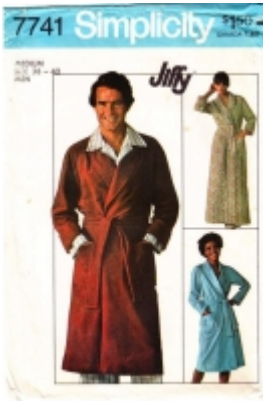
Simplicity 7741 Mens Jiffy Front-Wrap Robe Sewing Pattern Medium C38-40 Uncut $5.00

MEN'S PAJAMAS: The pajama top with front button closing, has long set-in sleeves, patch pockets, buttons and buttonholes or decorative snap fasteners and top-stitching trim. V. 1 has shirt type collar. V. 1 & 2 have long sleeves. V. 2 & 3 have "V" shapedM [Product Details...]