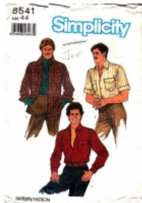
Simplicity 8541 Men's Button Front, Patch Pocket, Long or Short Sleeve Shirt Sewing Pattern 44 Used $5.00