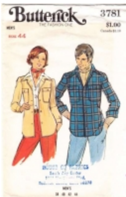
Butterick 3781 70s Men's Button Front Shirt Shirtjacket Sewing Pattern 44 $5.00

MEN'S SHIRT: The top-stitched shirt with button and buttonholes or decorative snap fasteners, has yoke, collar and collar band, set-in sleeves, shirt-tail hem and pockets with flaps. V. 1 has lona sleeves with cuffs. V. 2 has short sleeves with tuck detai [Product Details...]