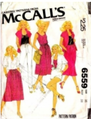
McCalls 6559 Shirt, Tank Top, Skirt, Pants, Shorts Sewing Pattern 16 B38 Used $5.00

MISSES' AND JUNIOR PETITE SHIRT, TOP, SKIRT AND PANTS OR SHORTS: Buttoned shirts, gathered into yoke with forward and extended shoulder line have kimono sleeves and collar; sleeves A, E gather into bands; sleeves B, C have turned up bands. Bias cut, pullo [Product Details...]