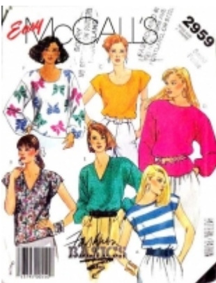
McCalls 2959 80s Wide Shoulder Pullover Tops Sewing Pattern Small B32-34 Used $5.00

MISSES' AND JUNIOR PETITE SHIRT, TOP, SKIRT AND PANTS OR SHORTS: Buttoned shirts, gathered into yoke with forward and extended shoulder line have kimono sleeves and collar; sleeves A, E gather into bands; sleeves B, C have turned up bands. Bias cut, pullo [Product Details...]