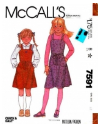
McCalls 7591 Girls' Jumper Dress Sewing Pattern 12 B30 Uncut $5.00

GIRLS' JUMPER: Top-stitched, back-wrap jumper has shoulder straps, tie belts and patch pockets. Purchased applique is optional. [Product Details...]