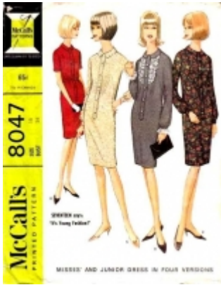
McCall's 8047 60s Peter Pan Collar Shift Dress Sewing Pattern 16 B36 Used $8.00

Misses' and Junior Dress in Four Versions: Dart fitted dress with buttoned front band, faced and interfaced collar, has choice of long or short set-in sleeves. Dress with ruffles of lace edging on front and included in band seams, has lace ruffles sewn to [Product Details...]