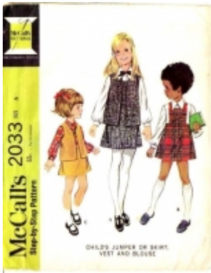
McCall's 2033 Child's Jumper Dress, Skirt, Vest & Blouse Sewing Pattern 6 Used $4.00

Misses' and Junior Dress in Four Versions: Dart fitted dress with buttoned front band, faced and interfaced collar, has choice of long or short set-in sleeves. Dress with ruffles of lace edging on front and included in band seams, has lace ruffles sewn to [Product Details...]