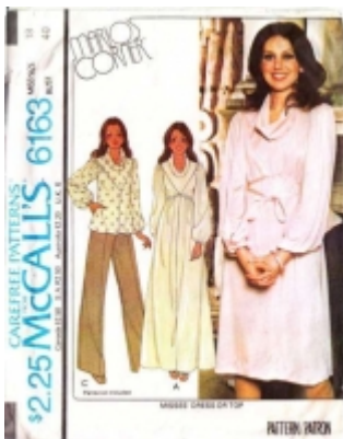
McCall's 6163 Cowl Neck' Dress or Top Sewing Pattern 18 B40 Used $5.00

CHILD'S JUMPER OR SKIRT, VEST AND BLOUSE: Front buttoned blouse with long set-in sleeves, open front lined vest and jumper or skirt. Blouse has interfaced fronts, faced collar sewn to neck edge and sleeves gathered into buttoned bands. Jumper or skirt have [Product Details...]