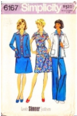
Simplicity 6167 70s Look Slimmer Jacket, Top, Skirt & Pants Sewing Pattern 16 B38 Uncut $5.00