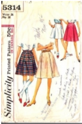
Simplicity 5314 60s Flared Skirt Sewing Pattern Waist 26 Used $5.00

SKIRTS IN TWO LENGTHS: V. 1 gored skirt is slightly flared with top-stitched pleats in front and back and a side zipper closing. The skirt is fitted to a waistband. Four buttons trim the front. In V. 2, the buttons are omitted. The skirt has belt carriers [Product Details...]