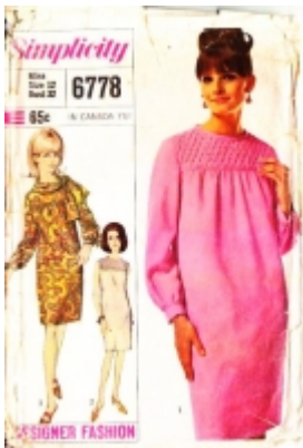
Simplicity 6778 60s Smocked Dress & Scarf Sewing Pattern 12 B32 Used $5.00