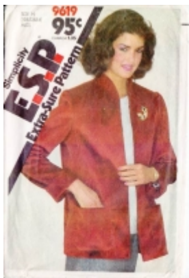
Simplicity 9619 Unlined Boxy Jacket Patch Pockets Pattern 10-12 B32-34 $5.00

MISSES' JIFFY® FRONT WRAP SKIRT: The skirt without seams has waistband and tie ends. [Product Details...]