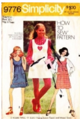
Simplicity 9776 Scoop Neck Sun Dress, Mini Dress-Jumper Sewing Pattern Junior/Teen 9/10 B30" Used $5.00

MISSES' UNLINED JACKET: Boxy jacket has front princess seaming, high funnel neckline, long set-in sleeves with turn-back cuffs and patch pockets. [Product Details...]