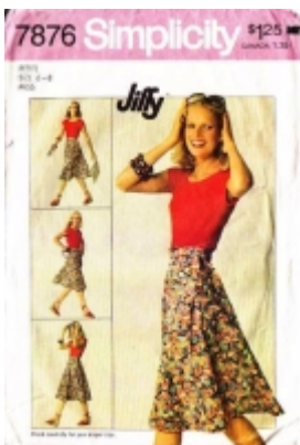
Simplicity 7876 Jiffy Front Wrap Skirt Sewing Pattern 6-8 Waist 23-24" Used $5.00