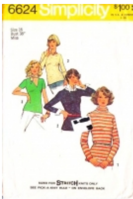
Simplicity 6624 70s V-Neck Stretch Knit Tops Sewing Pattern 16 B38 Used $5.00

MISSES' SUPER JUFFY® JUMPSUIT IN TWO LENGTHS AND WRAP-SKIRT: The sleeveless long or short jumpsuit with back zipper has loop and button closing at keyhole high round neckline and optional purchased belt. The short jumpsuit has elastic leg casings. The wrap [Product Details...]