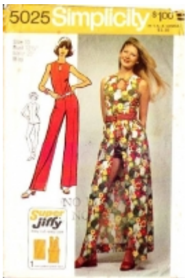
Simplicity 5025 70s Jumpsuit, Romper, Wrap Skirt Sewing Pattern 10 B32 Used $8.00

SKIRTS IN TWO LENGTHS: V. 1 gored skirt is slightly flared with top-stitched pleats in front and back and a side zipper closing. The skirt is fitted to a waistband. Four buttons trim the front. In V. 2, the buttons are omitted. The skirt has belt carriers [Product Details...]