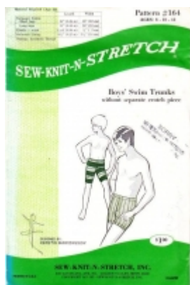
Sew-Knit-N-Stretch 164 Boys' Jammer Swim Trunks Sewing Pattern 8-12 Uncut $5.00

MISSES' AND WOMEN'S DRESS OR TUNIC, VEST AND PANTS: The dress or tunic with back zipper has long set-in sleeves, low "V" shaped neckline and tie collar fastened with optional purchased ring. The vest is lined. The pants with back zipper have elastic waist [Product Details...]