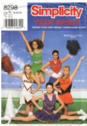
Simplicity 8298 Pleated Cheerleading Costume Skirt with Sleeveless V-Neck Top Sewing Pattern 10-14 B32-36" Uncut $5.00

Girls' Unlined Jacket with or without Hood, Pants and Shorts: A Time-Saver Stretch-Knit Pattern. Jacket View 1, 2, or 3 with front zipper has long raglan sleeves with elastic casings, front pockets and drawstring thru lower casing. Views 1 & 3 have colla [Product Details...]