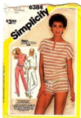
Simplicity 6384 Stretch Knit Short Shorts & Warm-up Pants with Pullover Top Sewing Pattern 10-14 B32-36 Uncut $5.00

Sew-Knit-N-Stretch Boys' Swim Trunks without separate crotch piece [Product Details...]