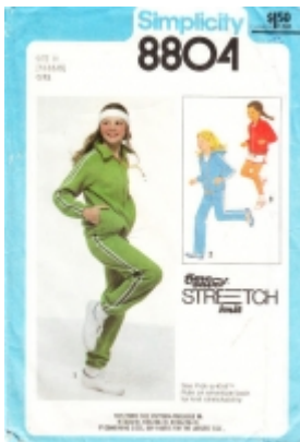
Simplicity 8804 Girls 1970s Track Suit, Jacket & Pants, Athletic Shorts Sewing Pattern 7-10 Uncut $5.00

MISSES' DRAWSTRING PANTS OR SHORTS AND SKIRT: Pants, top-stitched shorts and skirt have self drawstring thru waistline casing. [Product Details...]