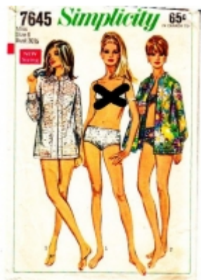
Simplicity 7645 60s Swimsuit Bottom, Cover-up Shirt Sewing Pattern 6 Hip 32" Used $4.50

MISSES' AND WOMEN'S DRESS OR TUNIC, VEST AND PANTS: The dress or tunic with back zipper has long set-in sleeves, low "V" shaped neckline and tie collar fastened with optional purchased ring. The vest is lined. The pants with back zipper have elastic waist [Product Details...]