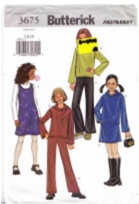
Butterick 3675 Girls' Jumper, Top, Skirt, Pants Sewing Pattern 7-10 Uncut $5.00

GIRLS' JUMPER, TOP, SKIRT AND PANTS Easy fit, pullover jumper A is sleeveless. Loose-fitting pullover top B has hood and long flared sleeves. Pull-on skirt C and pants D have elasticized waist. All garments have machine-stitched hems. [Product Details...]