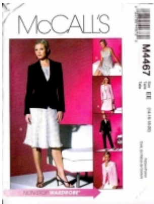
McCalls 4467 Semi-Fitted Jacket, Top, Bias Skirt & Pants Sewing Pattern Plus Size 14-20 B38-44 Uncut $5.00

MISSES' UNLINED JACKET, TOP, DRESS, COWL, PANTS AND SKIRT: Wrap front jacket has pleated right front and side tie; top and dress have back zipper; pullover cowl has center back seam; pull-on pants and skirt have casing and elastic waist. [Product Details...]