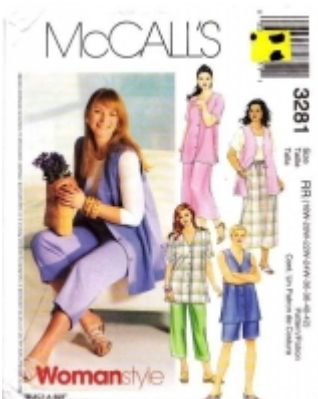
McCall's 3281 Plus Size Shirt, Vest, Pull-on Skirt, Cropped Pants, & Shorts Sewing Pattern 18-24W B40-46 Uncut $5.00

GIRLS' JUMPER, TOP, SKIRT AND PANTS Easy fit, pullover jumper A is sleeveless. Loose-fitting pullover top B has hood and long flared sleeves. Pull-on skirt C and pants D have elasticized waist. All garments have machine-stitched hems. [Product Details...]