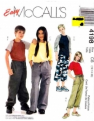
McCall's 4198 Childs' Ringer Style Tops & Pants Sewing Pattern 12-16 Uncut $5.00

BOYS'/GIRLS' TOPS AND PANTS IN TWO LENGTHS -TOPS FOR STRETCH KNITS ONLY: Pullover top has neckband, stitched hems and short or long sleeves; top B or D has contrast sleeves; pants in two lengths have drawstring waist, pockets and mock fly zipper closure; p [Product Details...]