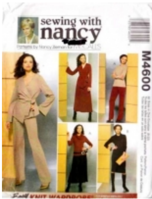
McCalls 4600 Wrap Jacket, Dress, Cowl Neck Top, Pants, & Skirt Sewing Pattern XS-XL B31-44 Uncut $5.00

MISSES' UNLINED JACKET, TOP, DRESS, COWL, PANTS AND SKIRT: Wrap front jacket has pleated right front and side tie; top and dress have back zipper; pullover cowl has center back seam; pull-on pants and skirt have casing and elastic waist. [Product Details...]