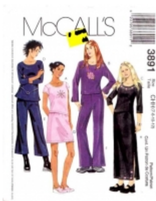
McCall's 3891 Girls' Tops, Pants & Skirts Sewing Pattern 7-12 Uncut $5.00

GIRLS' UNLINED JACKET, JUMPER AND PULL-ON PANTS: Jacket has front buttoned opening and topstitching detail: pullover jumper and pants with elastic at waist have side seam pockets. [Product Details...]