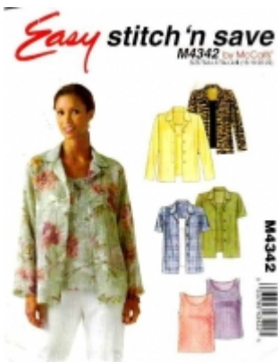
McCalls 4342 Long Sleeve Shirt & Tank Top Sewing Pattern Plus Size 16-22 B38-44 Uncut $5.00

MISSES'/MISS PETITE LINED JACKET, TOP, BIAS SKIRT AND PANTS: Semi-fitted, button front, lined jacket has long two-piece sleeves, notch collar, welts and back tab; semi-fitted, pullover top is sleeveless; semi-fitted, below mid-knee length skirt is slightl [Product Details...]