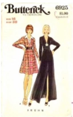
Butterick 6925 70s Evening Dress, Maxi Dress Sewing Pattern 16 B38 Uncut $7.00

MISSES'/MISS PETITE TOP AND SKIRT. [Product Details...]