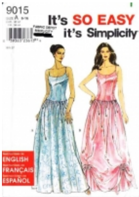
Simplicity 9015 Spaghetti Strap Bustier Top & Full Skirt, Prom, Wedding, Southern Belle Dress Sewing Pattern 6-16 B30-38 Uncut $5.00

MISSES'/MISS PETITE TOP AND SKIRT. [Product Details...]