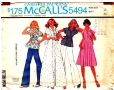
McCall's 5494 70s Gunne Sax Style Dress, Maxi Dress, or Top Sewing Pattern 14 B36 Uncut $9.99

MISSES' EVENING DRESS: Semi-fitted, A-line dress in two lengths has deep Vdecolletage neckline, full length or above wrist length dolman sleeves, and optional self cummerbund. Purchased blouse and belt. [Product Details...]