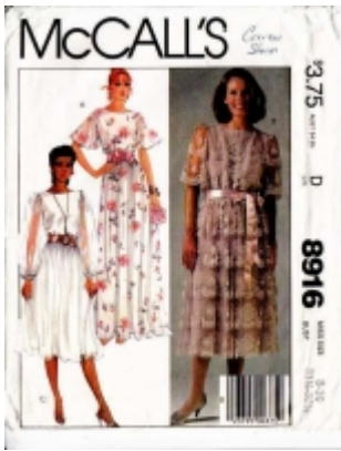
McCalls 8916 Flutter Sleeve Special Occasion Dress Sewing Pattern 8-10 B31-32 Uncut $8.00

MISSES' DRESS OR GOWN: Pullover gown A or dress B, C has underlined bodice with back zipper opening, elastic in waistline seam casing, full skirt and attached half-slip. Gown A has short, flared bias sleeves. Dress B, for border eyelet or lace, has short [Product Details...]