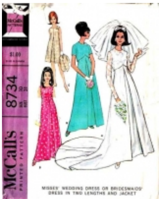
McCalls 8734 Vintage 60s Wedding Dress, Evening Gown Sewing Pattern 10 B31 Used $8.00

MISSES' DRESS OR GOWN: Pullover gown A or dress B, C has underlined bodice with back zipper opening, elastic in waistline seam casing, full skirt and attached half-slip. Gown A has short, flared bias sleeves. Dress B, for border eyelet or lace, has short [Product Details...]