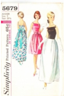
Simplicity 5679 60s Spaghetti Strap, Full Length Evening, Cocktail, Prom, Wedding, Bridesmaid Dress Sewing Pattern 9 B30 Used $9.99

MISSES' WEDDING DRESS OR BRIDESMAIDS' DRESS IN TWO LENGTHS AND JACKET: Sleeveless, dart fitted and lightly flared dress, in long length with or without train, and in short length, has underlay and inverted pleat at center front. Dress has faced neck and a [Product Details...]